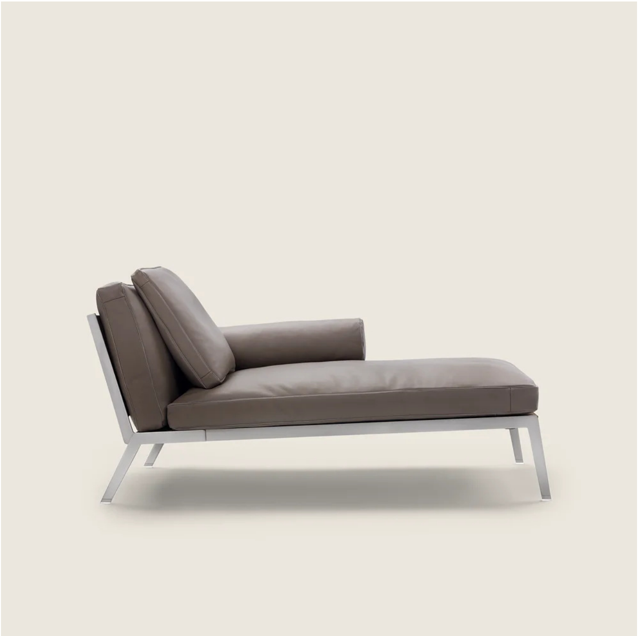
HAPPY ANTONIO CITTERIO 2005 CHAISE LONGUE/DORMEUSE