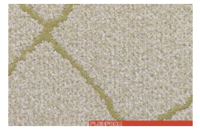
CAPO VERDE A251