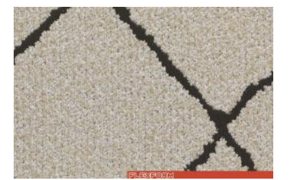
CAPO VERDE A254