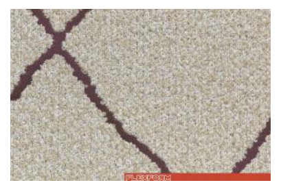
CAPO VERDE A252