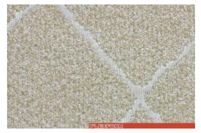
CAPO VERDE A250